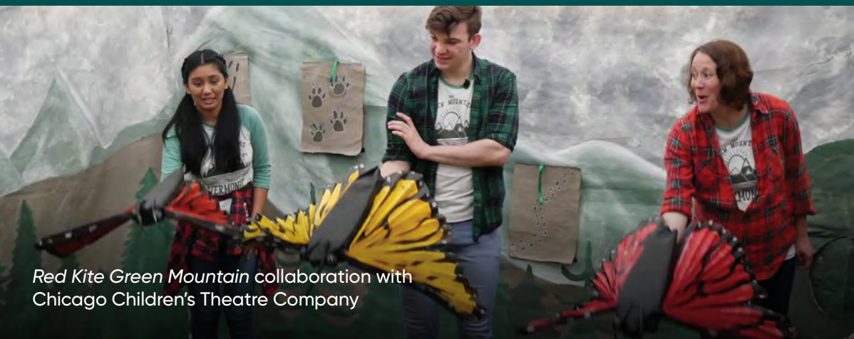
Red Kite Green Mountain collaboration with Chicago Children's Theatre Company

The Flynn's educational programs exemplify the themes of joy, curiosity, and belonging. In our community, school-based, and on-site programs, we craft classes and workshops that respond to the hopes and needs of folks of all ages, backgrounds, and abilities. In collaboration with community and school partners, and with our talented and dedicated faculty of teaching artists, we create pathways of engagement to and from the Flynn.