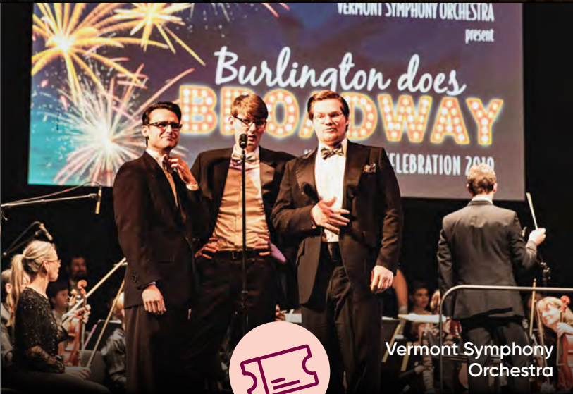
Vermont Symphony Orchestra

45% OF PERFORMANCES FEATURED VERMONT ARTISTS