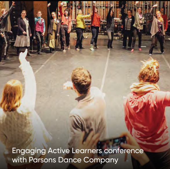
Engaging Active Learners conference with Parsons Dance Company

The Flynn's educational programs exemplify the themes of joy, curiosity, and belonging. In our community, school-based, and on-site programs, we craft classes and workshops that respond to the hopes and needs of folks of all ages, backgrounds, and abilities. In collaboration with community and school partners, and with our talented and dedicated faculty of teaching artists, we create pathways of engagement to and from the Flynn.