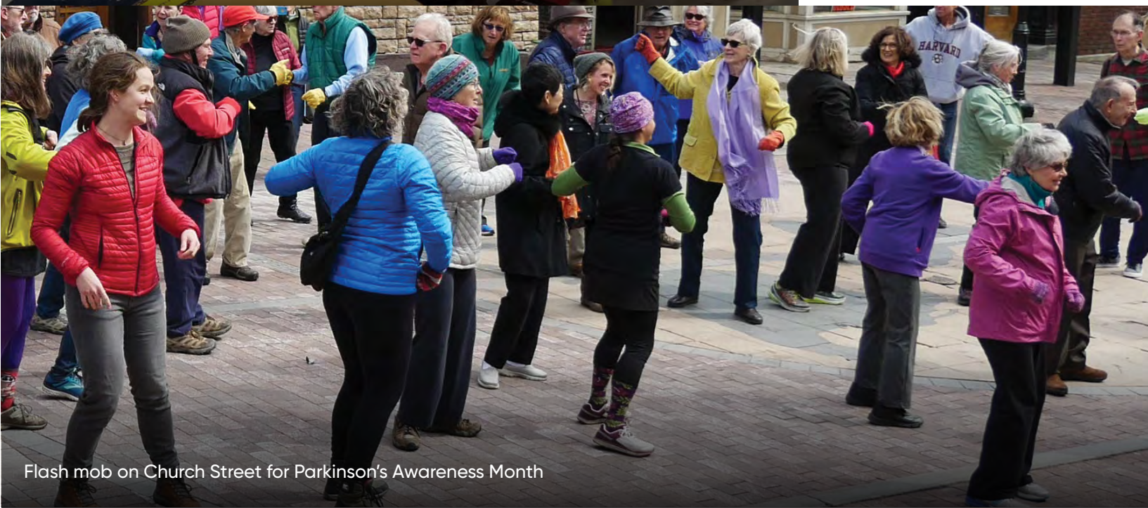
Flash mob on Church Street for Parkinson's Awareness Month