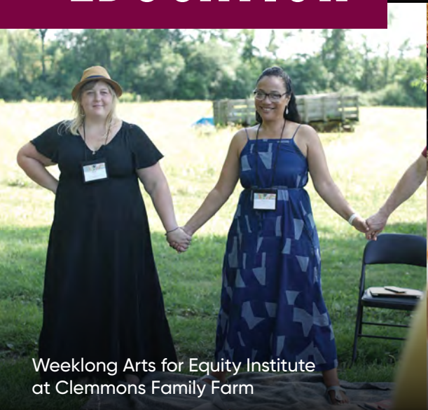
Weeklong Arts for Equity Institute at Clemmons Family Farm