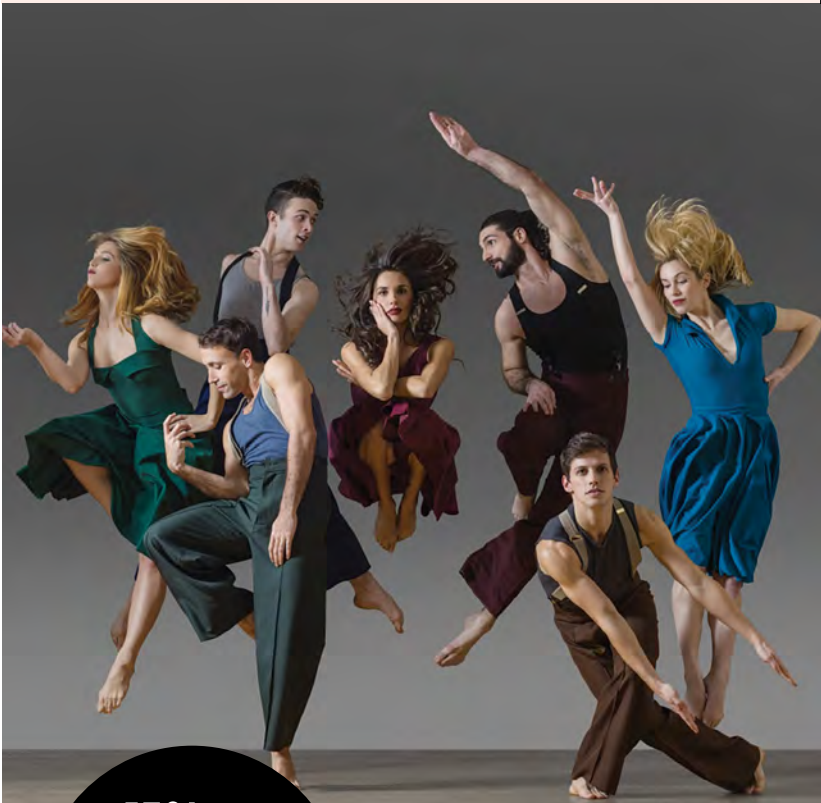
Parsons Dance Company

45% OF PERFORMANCES FEATURED VERMONT ARTISTS