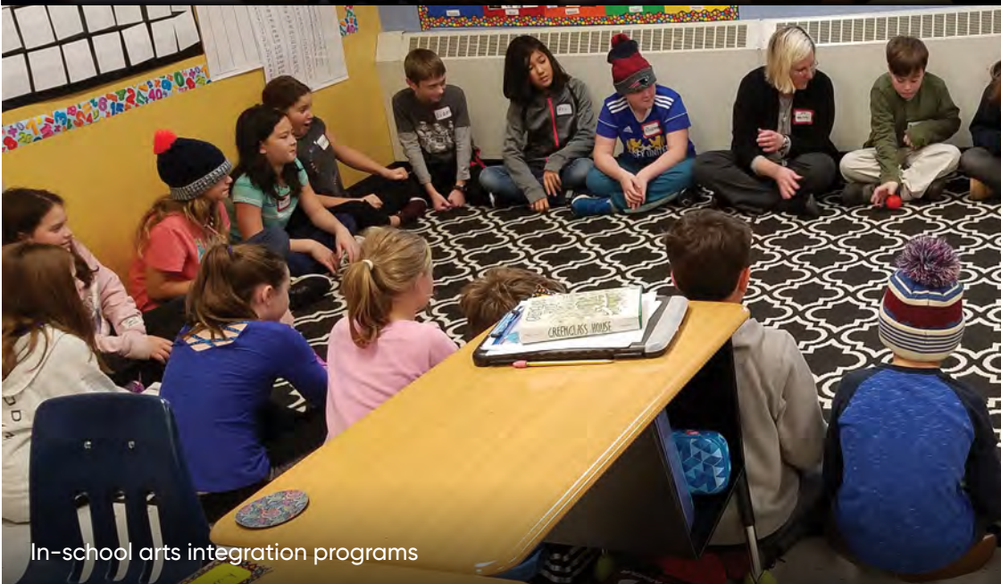
In-school arts integration programs